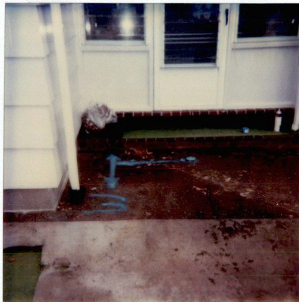
34 CLARENDON ST. NOV. 17, 1994 5' R.O.W. N 8" MAIN 1" SER.