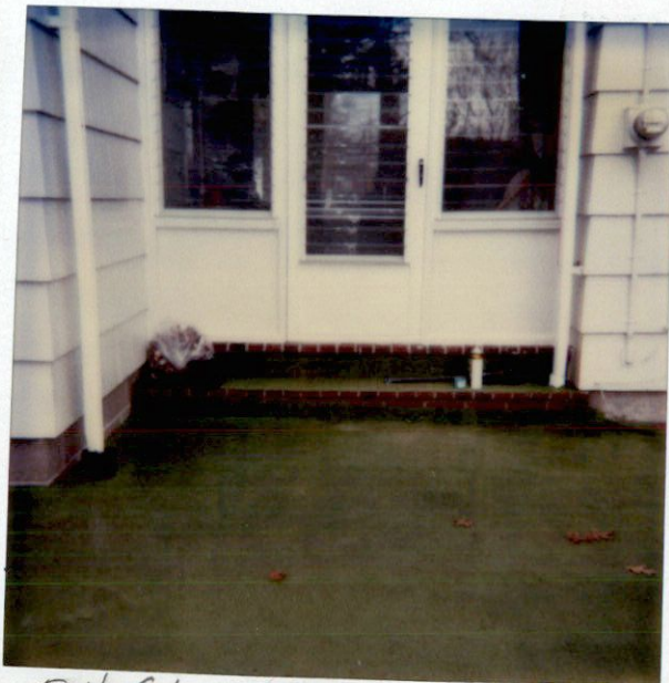
34 CLARENDON ST. NOV. 17, 1994