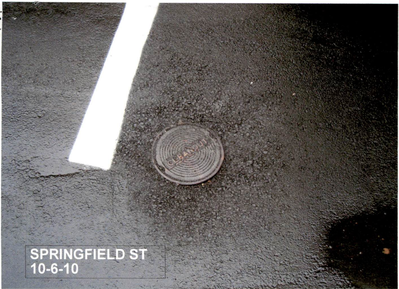
SPRINGFIELD ST 10-6-10