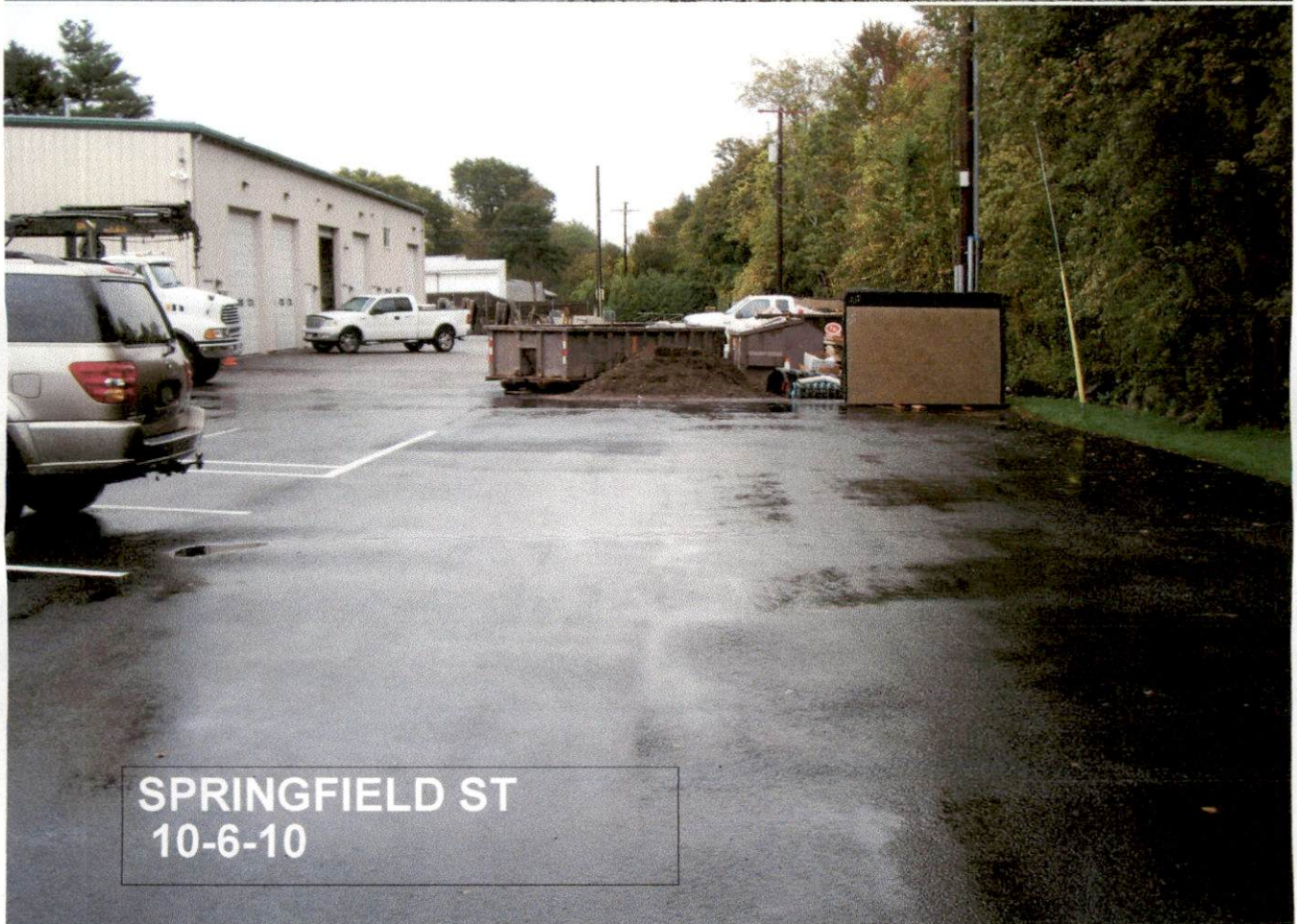
SPRINGFIELD ST 10-6-10