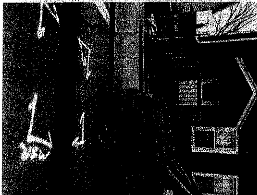
Hazard CT, New Bedford