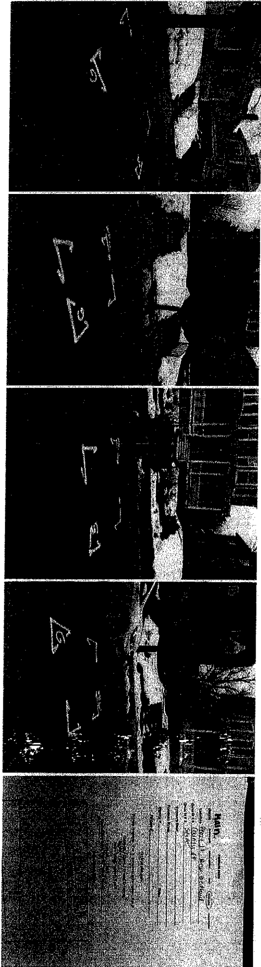
Pearl St, New Bedford