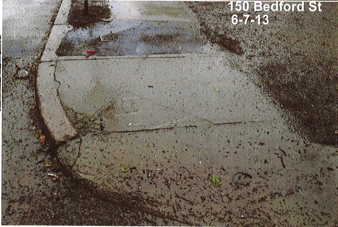
150 Bedford St 6-7-13