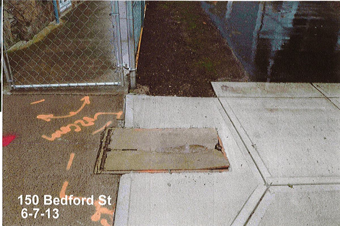
150 Bedford St 6-7-13