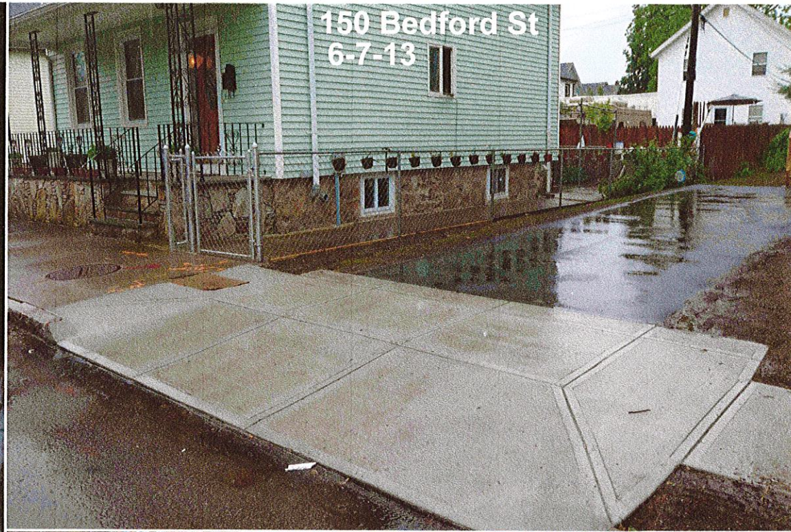
150 Bedford St 6-7-13