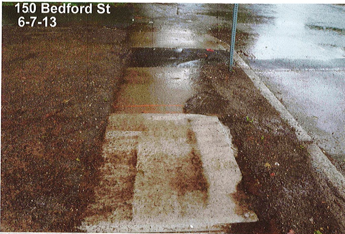
150 Bedford St 6-7-13